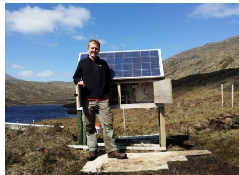
Base Station for the Trolamarig Fence

The fence now runs all the way from the Lacasdale Lochs to Loch Trolamarig and was switched on for the first time when the John Muir Trust volunteers helped to construct the base station in May. The fence has remained 'live' ever since, powered by a solar panel and small wind turbine. NHT staff now make regular visits to the fence to install gates, river crossings etc., inspect the fence and carry out any repairs.