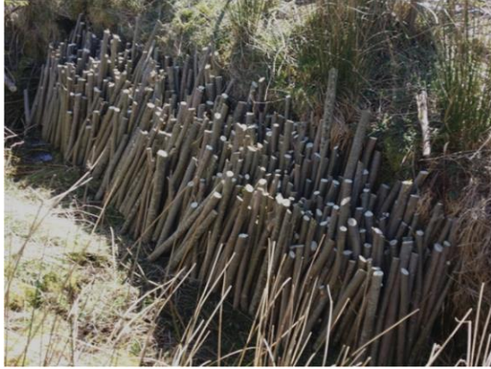
Willow cuttings ready for planting at Kyles.

Back in 2007, over 26,000 trees were planted over 2.5 ha. of croft land in Kyles to create an experimental short rotation coppice woodland and test the potential for generating biomass energy on the islands. About 50% of this trial site successfully established. NHT continues to manage the established trees and make efforts to re-stock the failed areas.