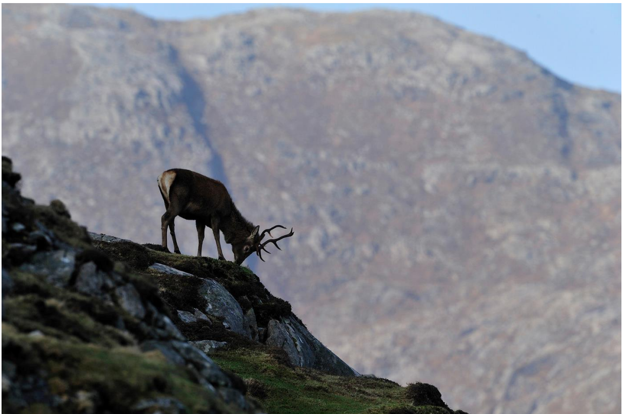
Stag on Rutting and Roaring Walk