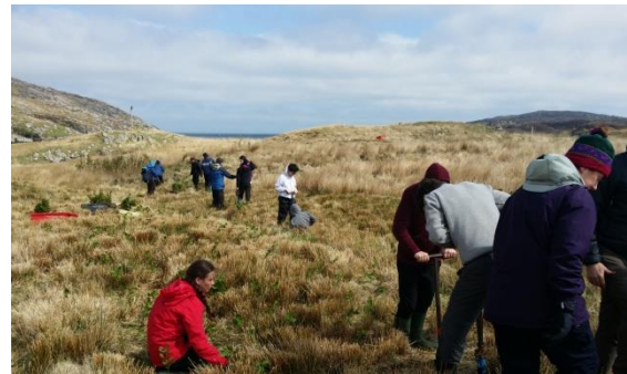
Tree planting with George Watson's College pupils

Unfortunately the rabbits continue to be a big problem causing serious losses especially to the willows. The area has been rabbit proofed and the fence has been maintained, but there is now a well established resident population within the fence. Members of the stalking club have been asked to shoot the rabbits whilst we to seek a better solution.