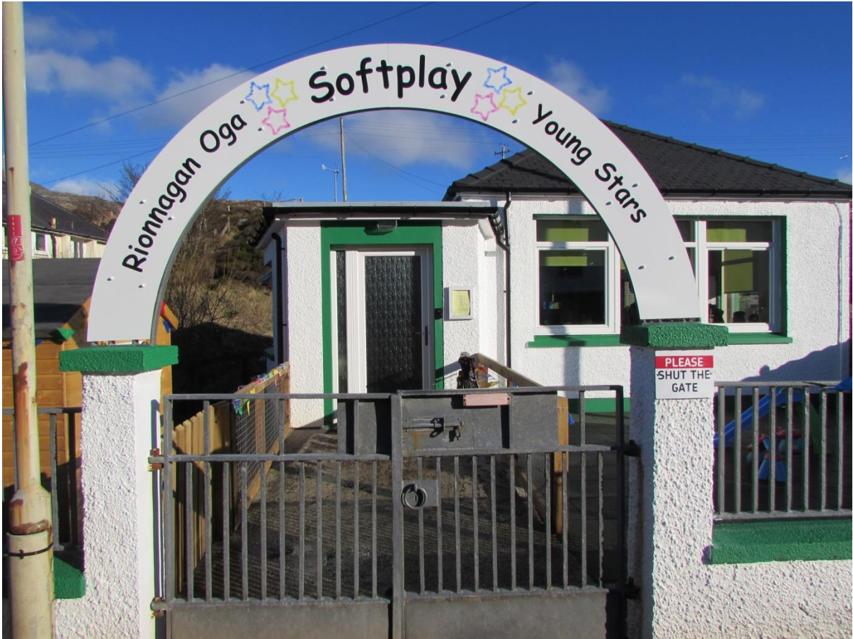
Old Croileagan Building