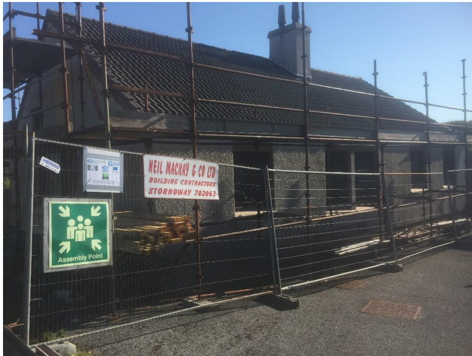
Scalpay Care Unit Refurbishment