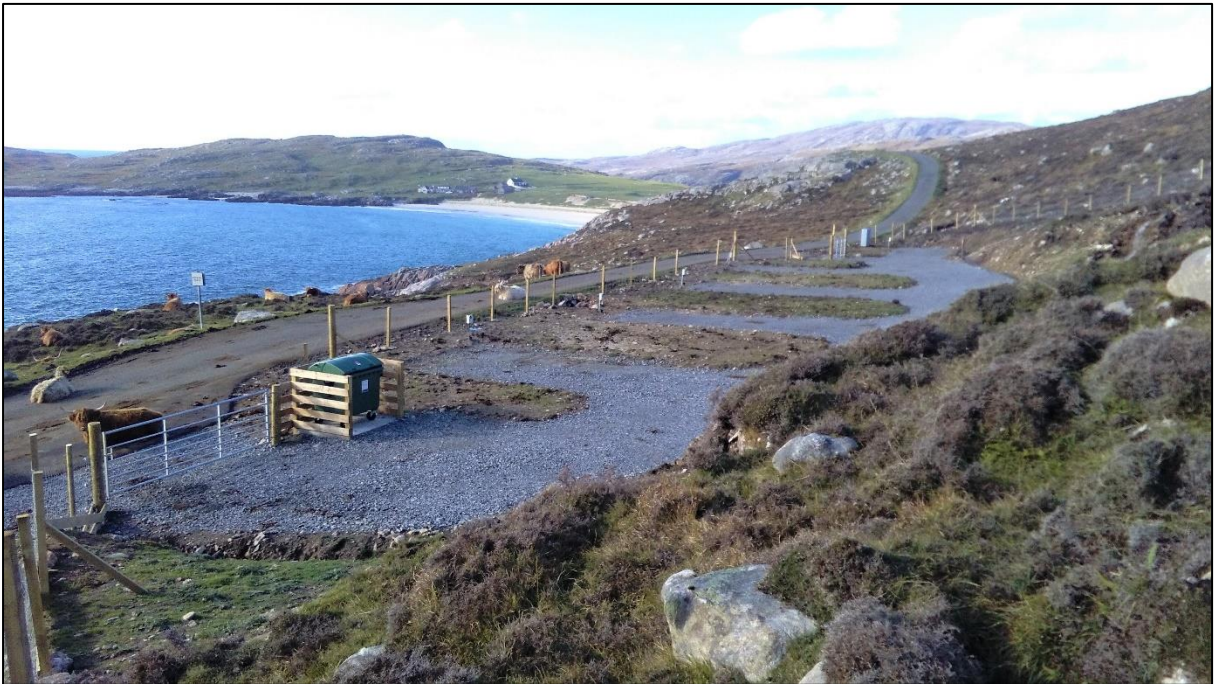
Huisinis Gateway Campervan Site