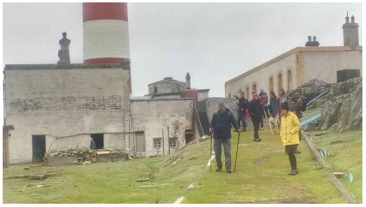
Scalpay Lighthouse Walk