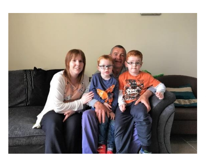
Creag Aonaich Tenants