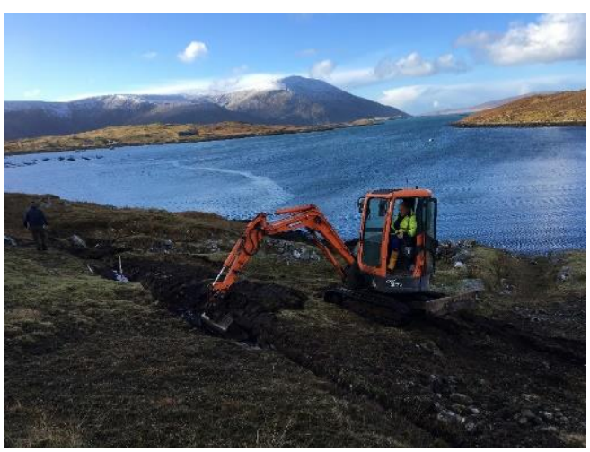
Whaling Station Drainage