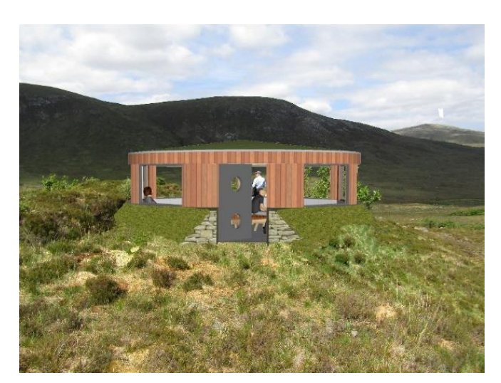
Proposed Ardvourlie Observatory